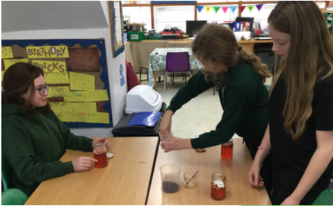
This week, Otters made 'blood' as part of their science learning which the children loved